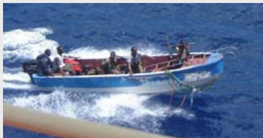
Pirate attack skiff