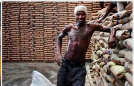
WFP in Mogadishu

As a result of its close cooperation with regional governments such as Kenya and The Republic of the Seychelles, suspected pirates captured by the EU NAVFOR have been transferred to competent authorities with a view to their prosecution and conviction.