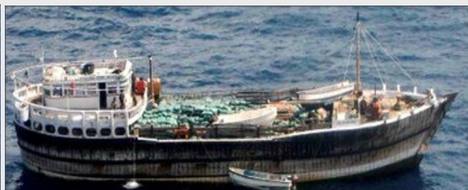
Pirate Mothership (dhow with skiffs)