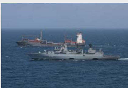
EU NAVFOR warship escort